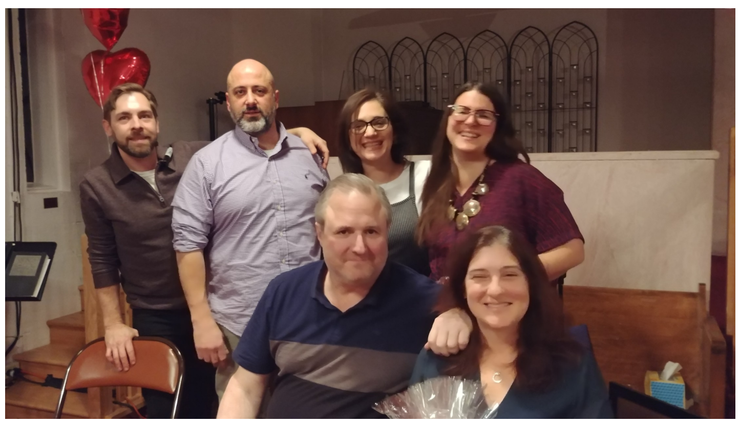
The contestants at the Not So Newlywed Talent Auction Event in February had fun and raised funds for SNUUC.

Please come for worship on March 29 ready to hear the good news of the roundtable's work — and to give generously.